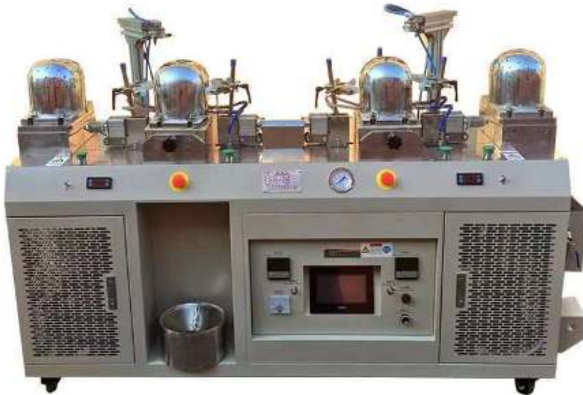
4 HEADS COLD & HEAT ATEAMER CAP IRONING MACHINE