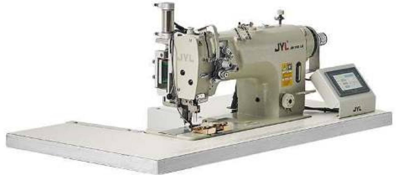
JYL DOUBLE NEEDLES PATCH SEWING MACHINE