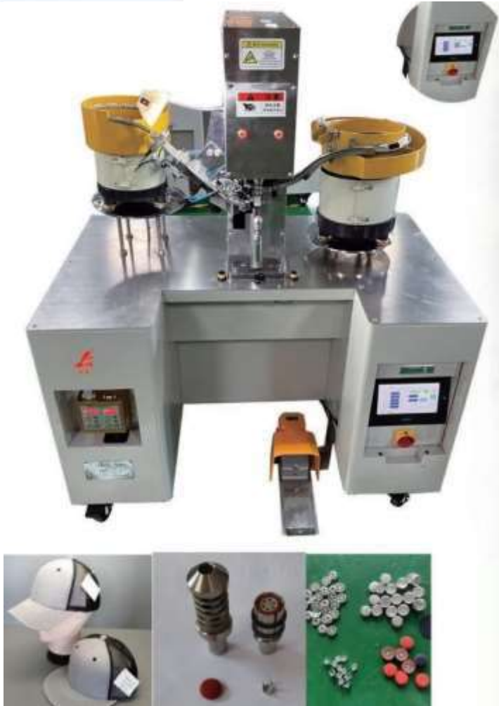
JYL AUTO TOP BUTTON ATTACHING MACHINE