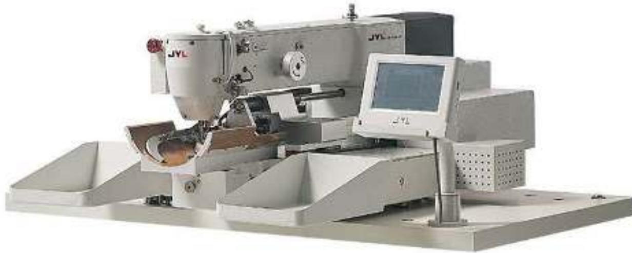
JYL CURVE UP BRIM SEWING MACHINE