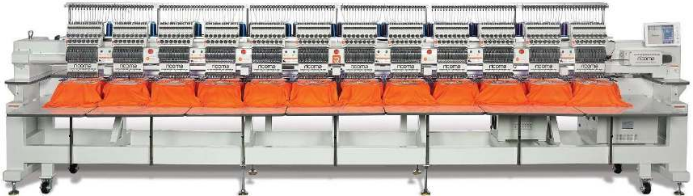
TUBULAR COMPUTERIZED EMBROIDERY MACHINE 12 NEEDLES, 12 HEADS