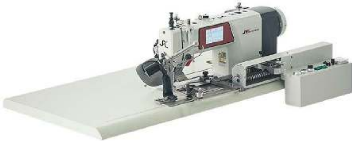
JYL BUCKET HAT SEWING MACHINE