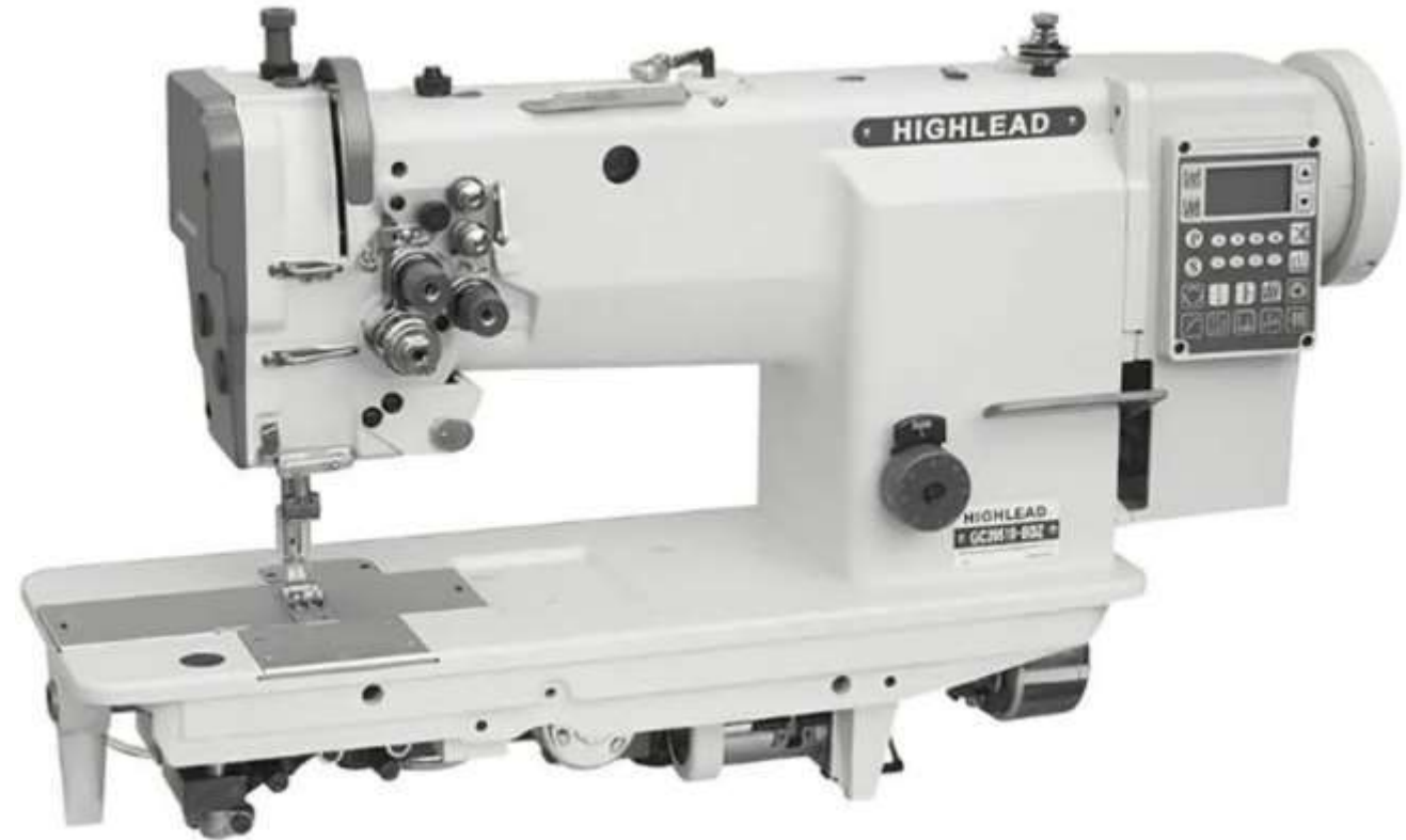
DIRECT DRIVE DOUBLE NEEDLE MACHINE