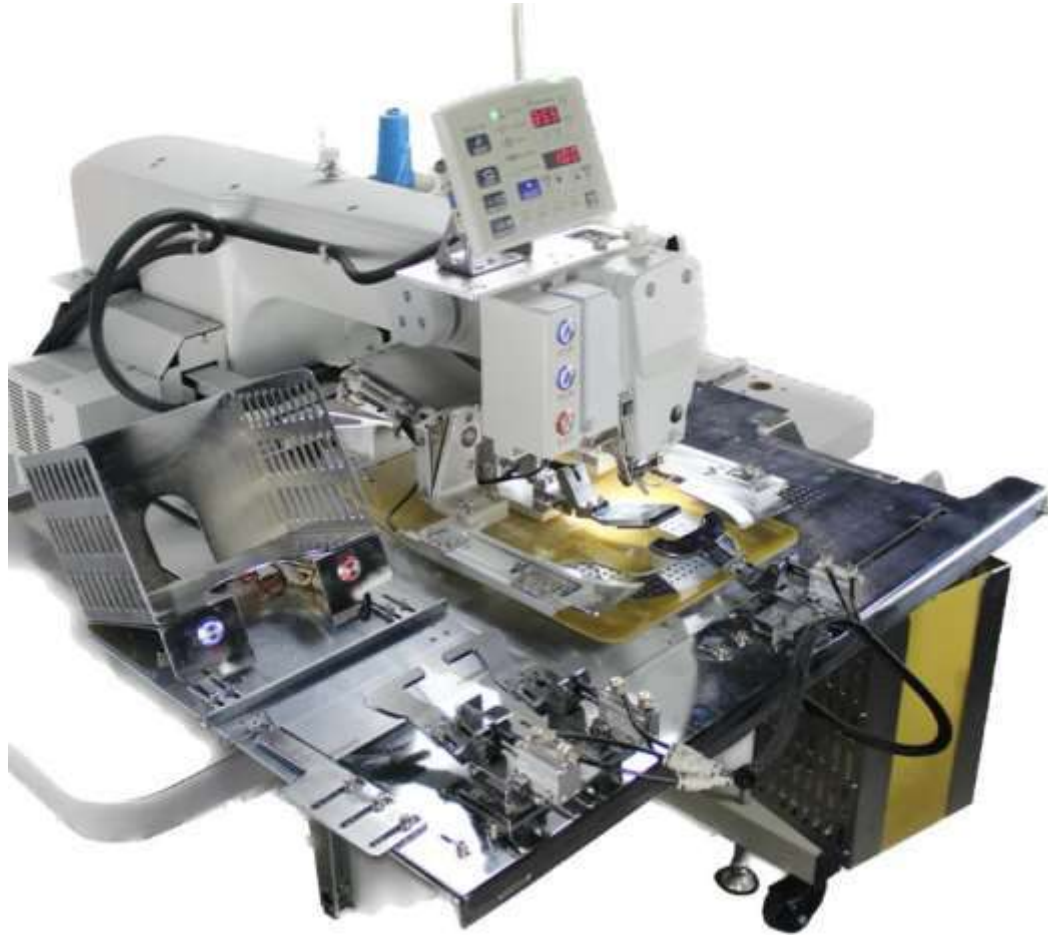
AUTOMATIC VISOR FABRIC COVERED MACHINE