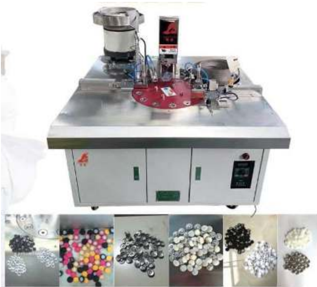
JYL AUTO FABRIC COVERED BUTTON MACHINE