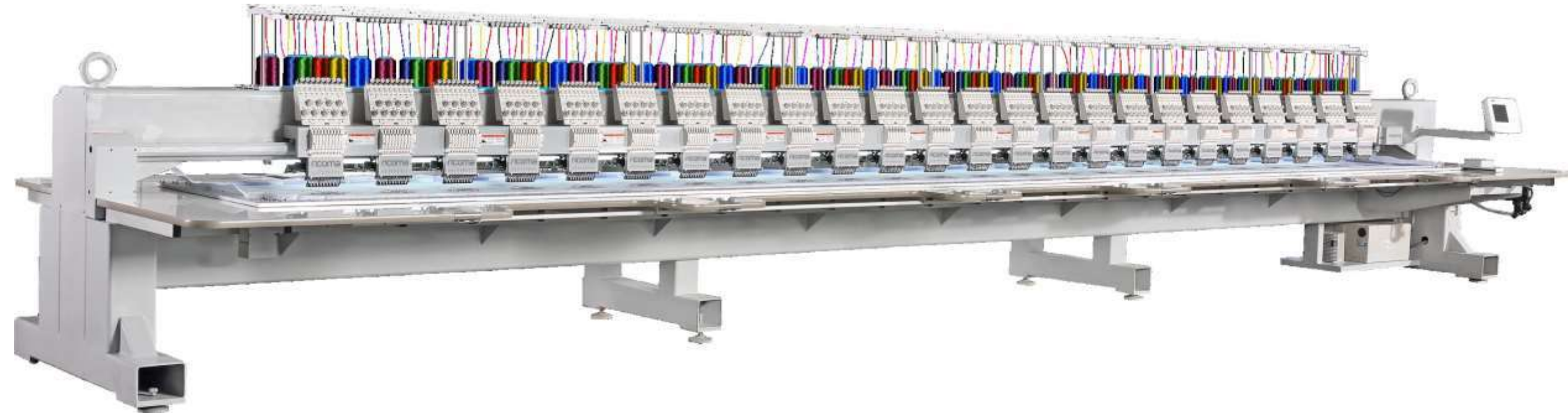
COMPUTERIZED EMBROIDERY MACHINE - 9 NEEDLES, 20 HEADS