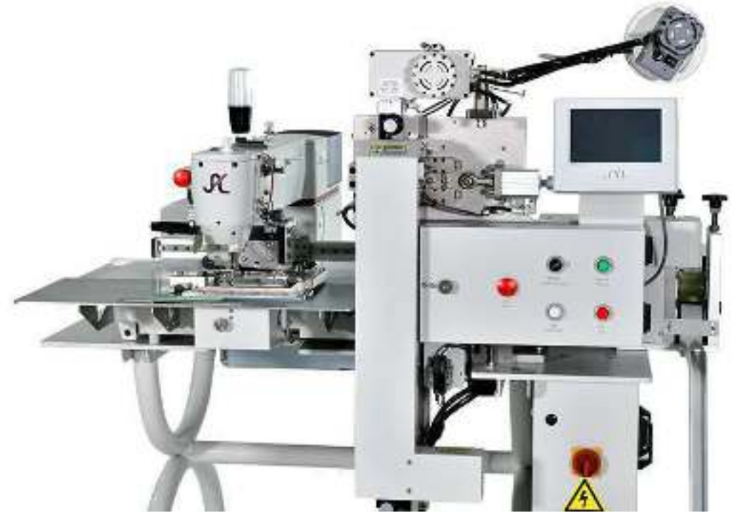
JYL STRAP SEWING MACHINE AUTOMATIC FEEDING & CUTTING