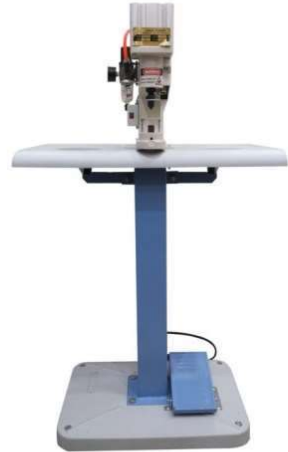
SEMI-AUTOMATIC CAP TOP BUTTON ATTACHING MACHINE