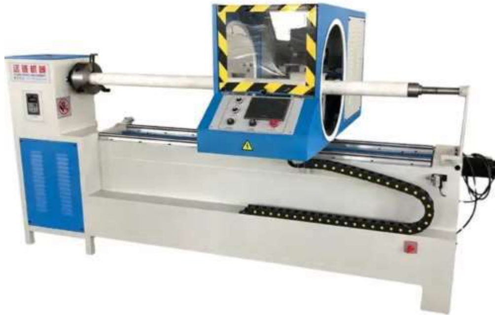
AUTOMATIC TAPE CUTTING MACHINE