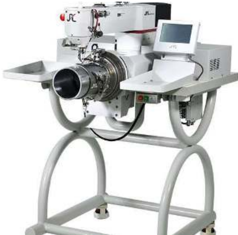
JYL COMPUTERIZED CURVED CAPS SEWING MACHINE