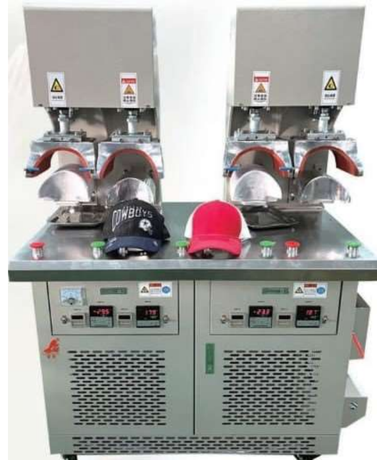
4 HEADS COLD & HEAT VISOR IRONING MACHINE