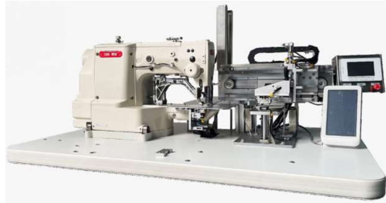
AUTOMATIC CAP EYELET SEWING MACHINE