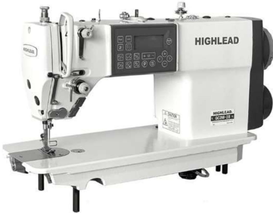
HIGHLEAD BRAND EXTRA HEAVY-DUTY PLAN MACHINE