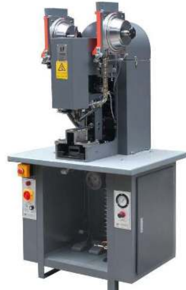
BACK BUCKLE GROMENT PUNCHING MACHINE