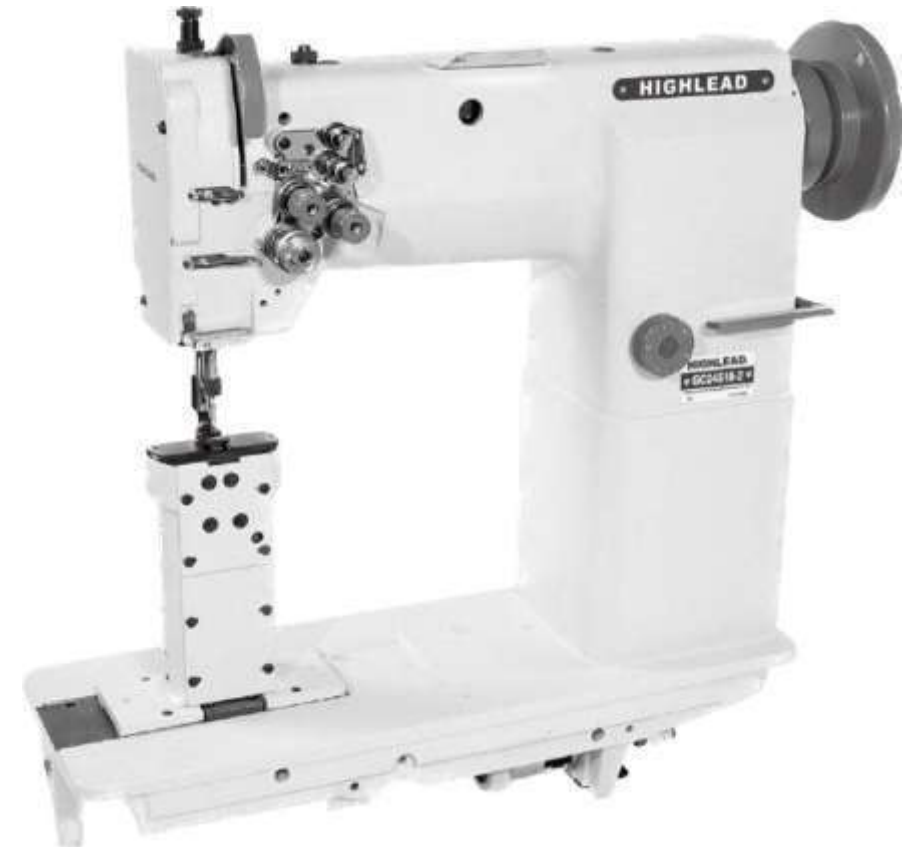
DIRECT DRIVE POST BED MACHINE