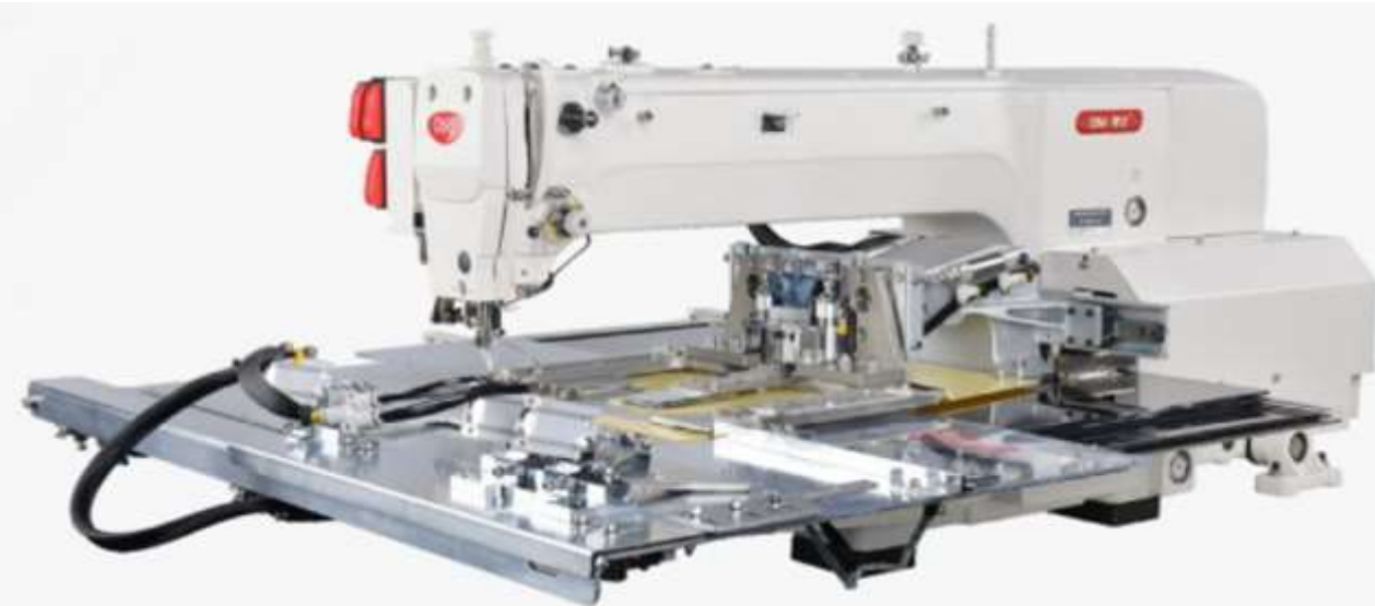
AUTOMATIC FLAT VISOR SEWING MACHINE