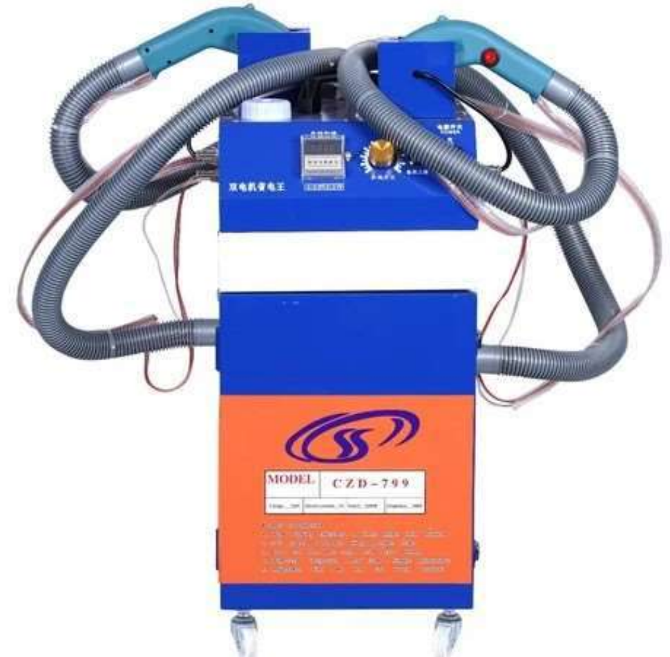
THREAD TRIMMING MACHINE