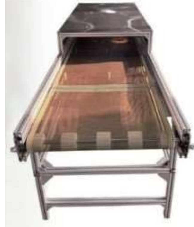
COOLING CONVEYOR BELT