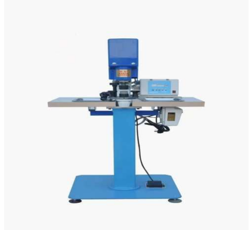
SEMI-AUTOMATIC BUTTON FABRIC COVERED BUTTON MACHINE