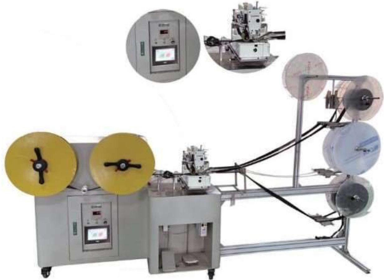
AUTOMATIC SWEATBAND MACKING MACHINE