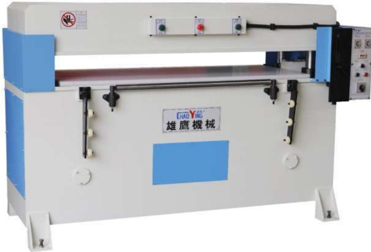
PRECISE HYDRAULIC FOUR COLUMN CUTTING MACHINE