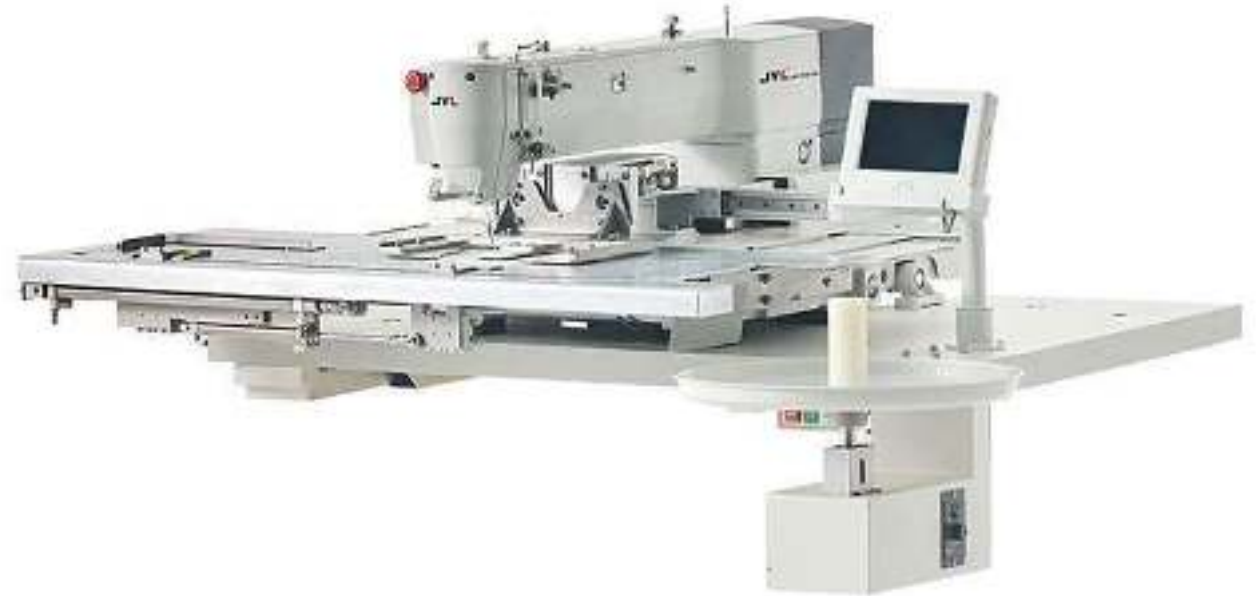
JYL SEMI AUTOMATIC COMPUTERIZED FLAT CAP SEWING MACHINE