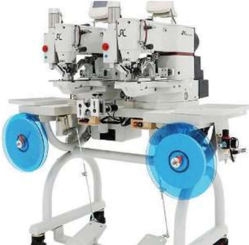
JYL DOUBLE STATION EYELET PUNCHING & SEWING MACHINE FOR CAPS