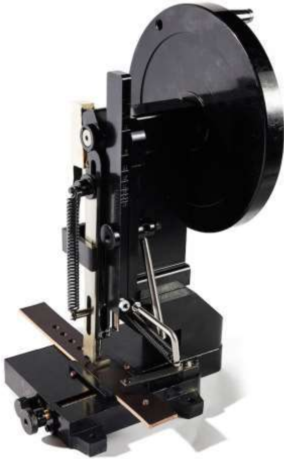
BACK BUCKLE HOLE PUNCHING MACHINE