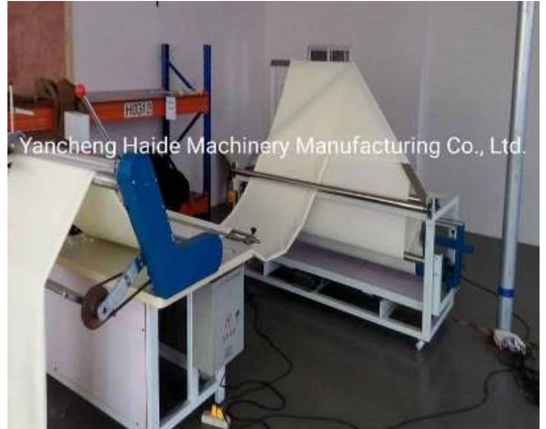
FABRIC FOLDED MACHINE