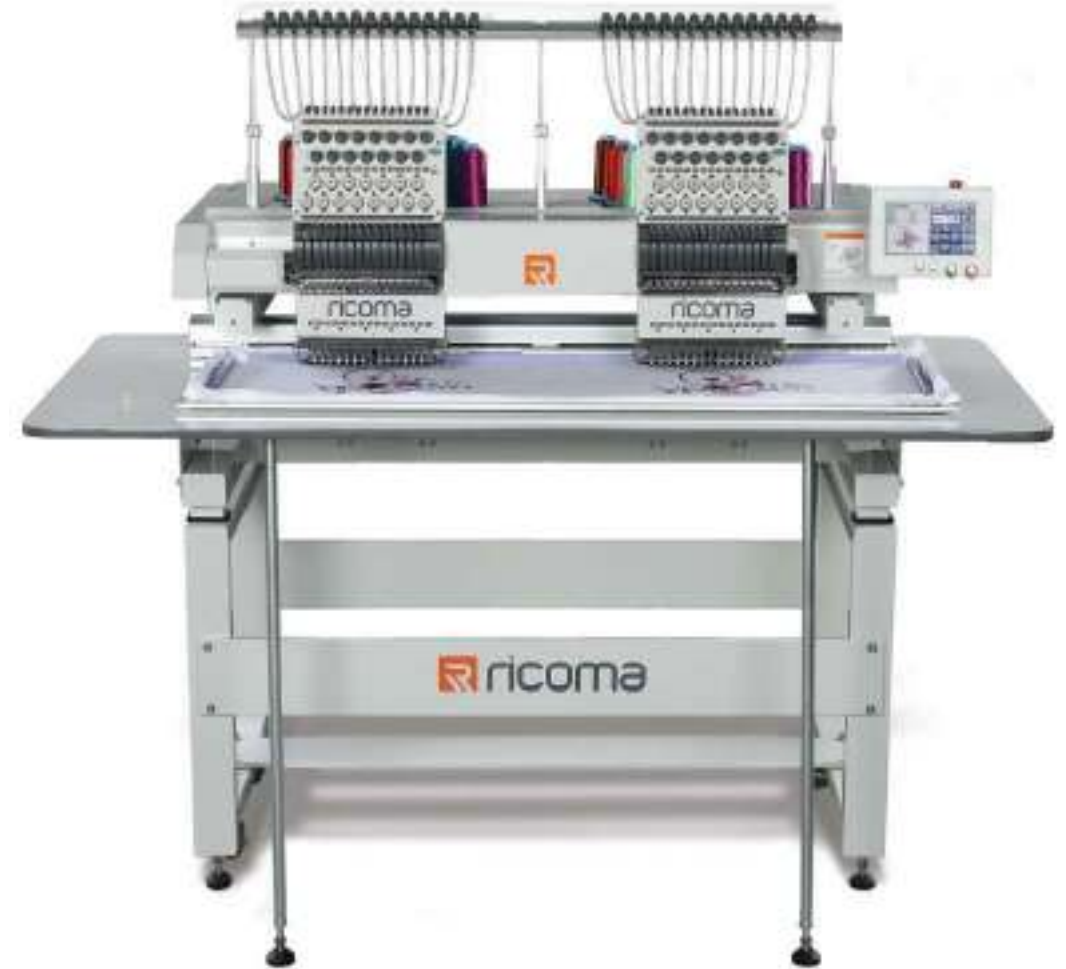
TUBULAR COMPUTERIZED EMBROIDERY MACHINE 12 NEEDLES, 2 HEADS, 7 INCH TOUCH SCREEN