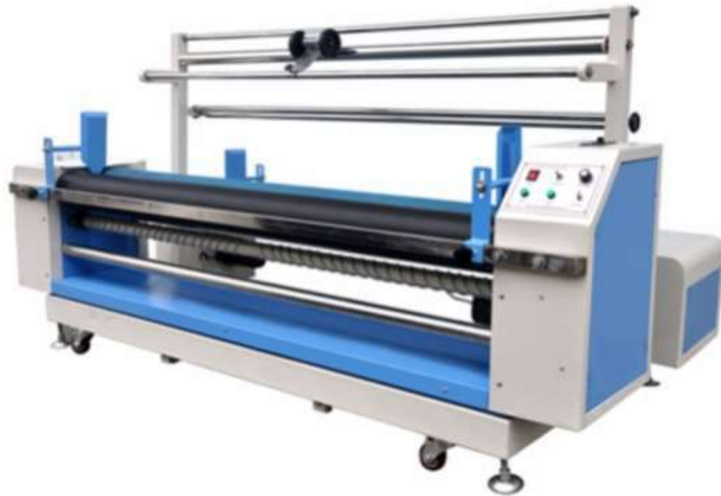
FABRIC ROLL MACHINE