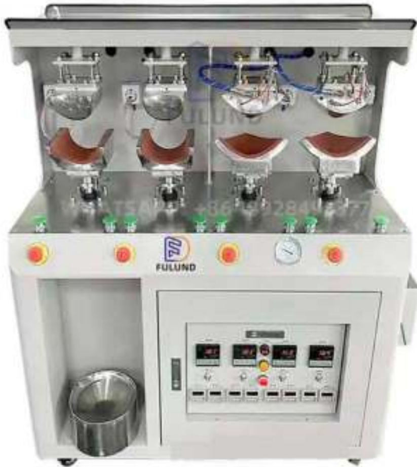
4 HEADS FRONT PANEL IRONING MACHINE